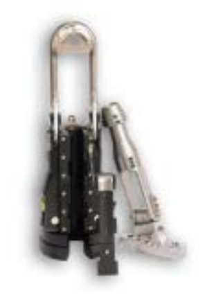
Mini Latch with term bullet For "live-boat" handling of small/medium ROV's