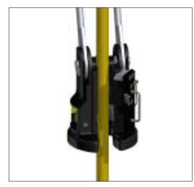
The Latch cable door is opened to insert tether cable into the latch.