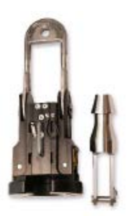
Midi Latch For "live-boat" handling of ROV's