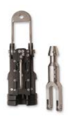
Micro Latch For "live-boat" handling of smaller ROV's

The Imenco ROV Latch Range is very well received by our customers and the feedback is excellent, with particular focus on the advantages these latches offer compared to other ROV launch/recovery systems. The Imenco ROV Latches are used worldwide in conjunction with Sub-Atlantic, Argus Remote Systems, Sperre Subfighter, Ocean Modules, ROV trenchers and other work ROV's from most major manufacturers. They are also used for other launching/ lifting applications where a messenger line and termination bullet can be attached.