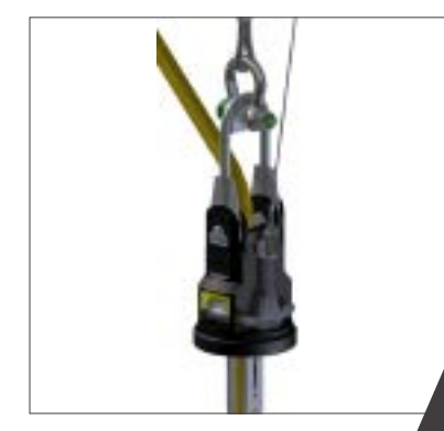
The ROV can be hoisted onto ship's deck by crane.