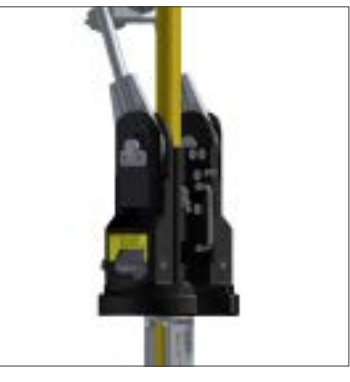
The Latch cable door is closed, latch lowered over the bullet until it is locked, indicated by lock flags.