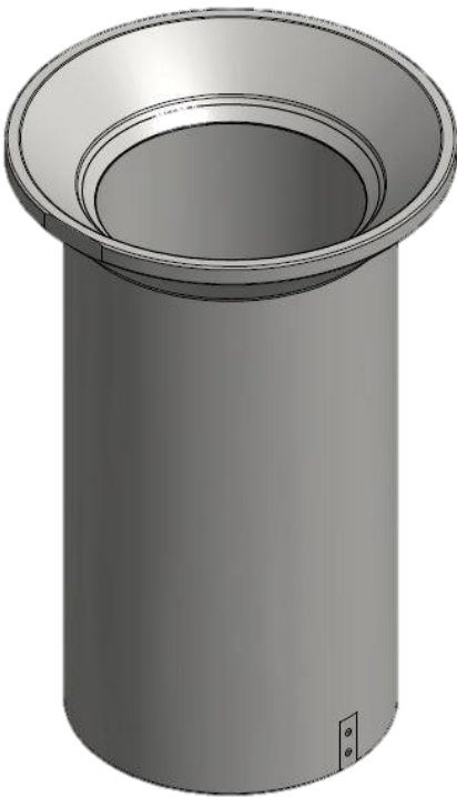
RECEPTACLE FOR TOP- and ANCHOR- RELEASEABLE GUIDE POST.